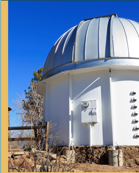
Lowell Observatory Flagstaff, AZ