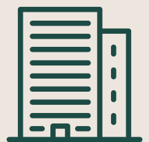
AGING COMMERCIAL BUILDINGS