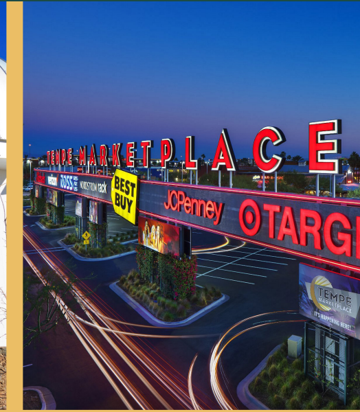
Tempe Marketplace Tempe, AZ