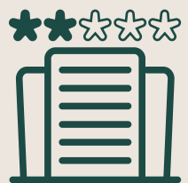
HOTELS AND MOTELS