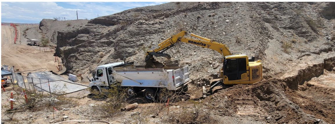
An excavator works to remove contaminated soil from federal land adjacent to compressor station property.

The Station is surrounded by federal and Tribal land that is home to sensitive plants, animals, and cultural resources. Recognizing the need to protect those resources and public health, DOI directed PG&E to remove soil from 15 locations on federal land or where contaminants could migrate to federal land. This non-time-critical removal action (NTCRA) began in July 2022 and was finished in May 2024. The NTCRA Completion Report will document work completed, including achievement of cleanup goals.