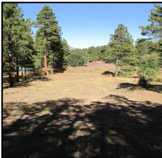
Figure 3: General Area of 2017 MEC Discovery

The MRS lies predominately on Coconino County Park land and is operated and open to the public as Fort Tuthill County Park. A portion of the MRS also lies on Fort Tuthill Luke Air Force Base Recreational Area, Coconino County Fairgrounds and Park is immediately to the east.