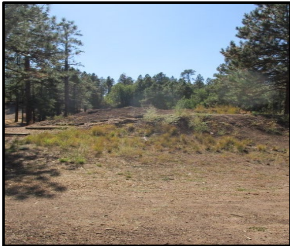
Figure 2: Small Arms Berm

Five relevant investigations/incidents have occurred at the NDNODS Fort Tuthill Small Arms Range Impact Area MRS. These include :