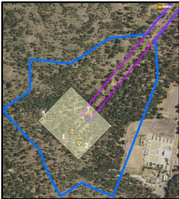
Figure 4: Conceptual “Focused” Removal Area

Note: 25-acre “Focused Area” graphic is representative only. Actual configuration (location and shape) would be finalized during Removal Action Systematic Project Planning meetings.